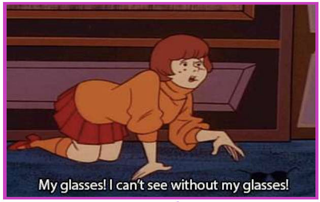
Vera , Scooby-Doo