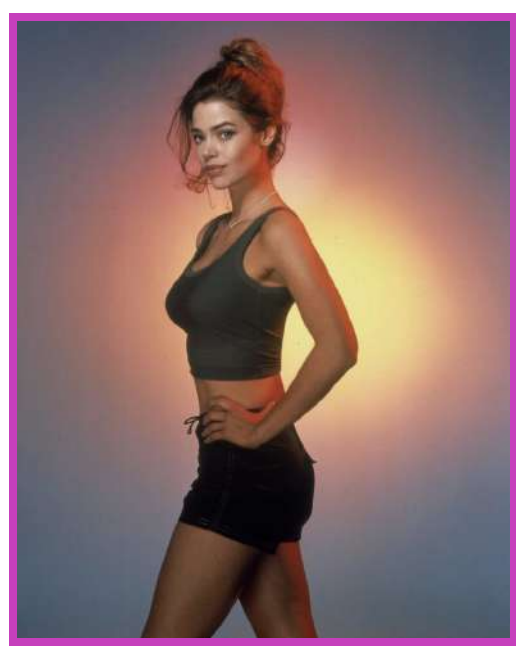
The female scientist in James Bond: Christmas Jones, The World Is Not Enough, 1999

They are regularly cast in the role of "femme fatale" who must necessarily use their charms rather than their intellectual faculties to get what they want. Men are not subject to these aesthetic constraints and are free to be ugly or even grotesque, since it is their expertise that justifies their relevance in the narrative;