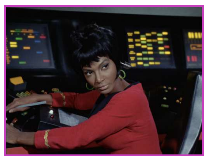
Lieutenant Nyota Uhura (Nichelle Nichols), Star Trek